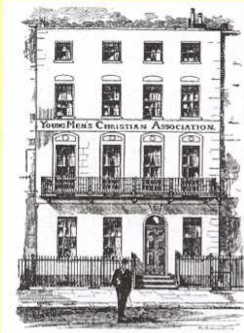
31 Cambray Place, 1898-1921