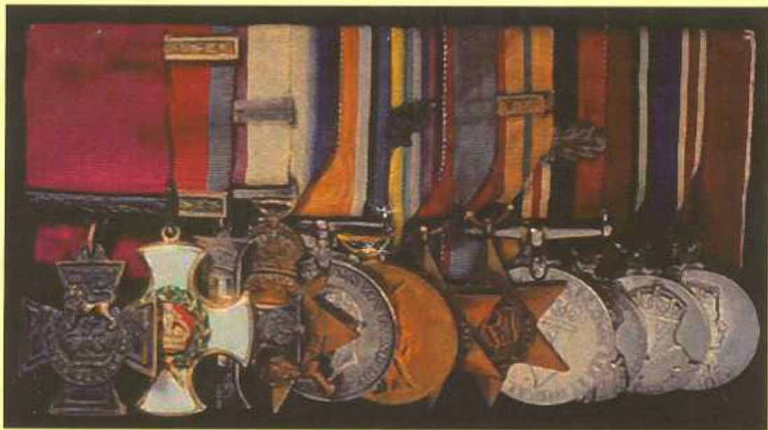
MEDALS AWARDED TO DANIEL BEAK

Cheltenham War Memorial 12.30 pm, 27th September 2006